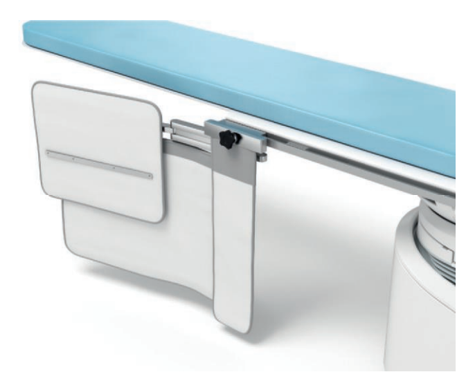
Table mounted radiation shield FCV0625

A table-mounted radiation shield for additional protection of physician and staff against scatter radiation