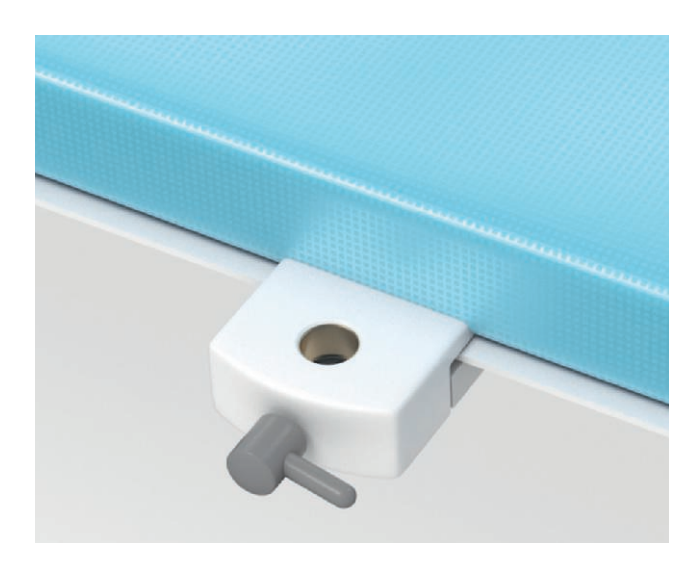
Table clamp FCV0249